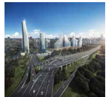
Upcoming dedicated Pantai Sentral Park interchange @ New Pantai Expressway

Built-up: 810 sf | 3 bedrooms, 2 bathrooms | Swimming pool | Covered car park